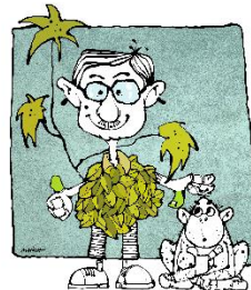
June 2021 Theme – Green Products

Click on the image on the right to download wallpaper for the month of June.