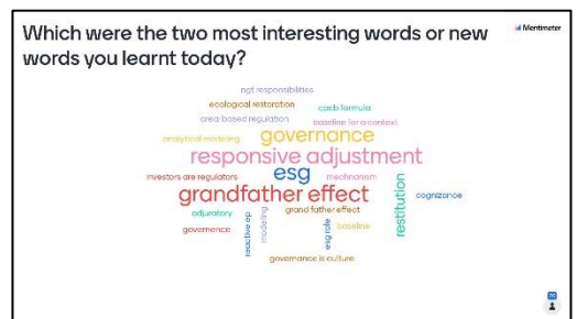
Snapshot from one of the interactive Mentimeter sessions