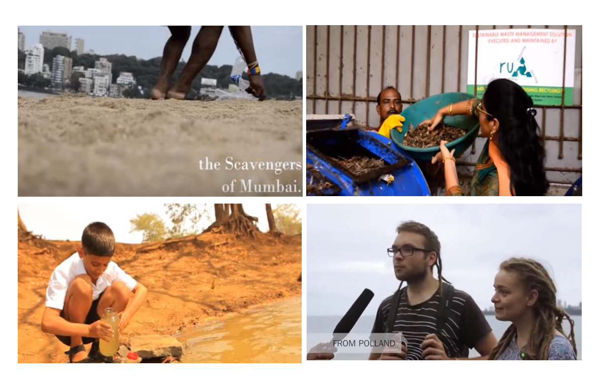
Short-Films screened in the programme

2. Film Screening: Three films were screened on the theme Waste to Resource viz; The Scavengers of Mumbai, Are you Reducing Reusing Recycling? & Cleanliness-It starts with ourselves.