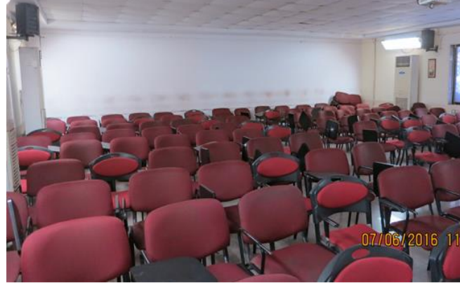
JSW World Environment Day Celebrations