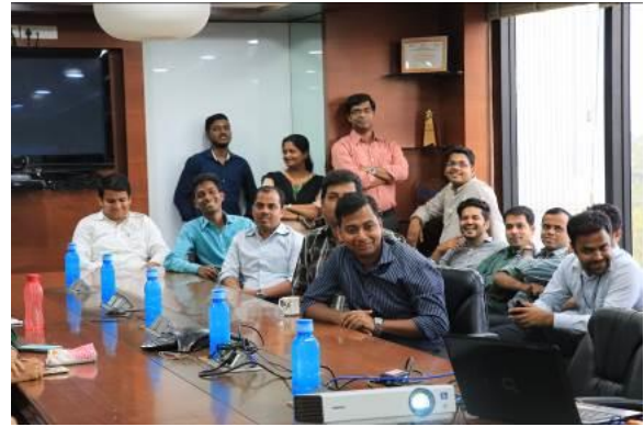
Participants during the presentation