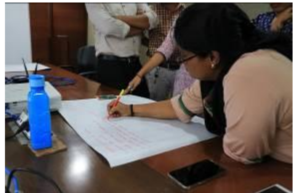
Groups at work creating their poster presentations