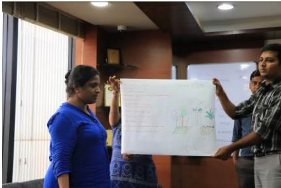
Presentation to the rest of the participants