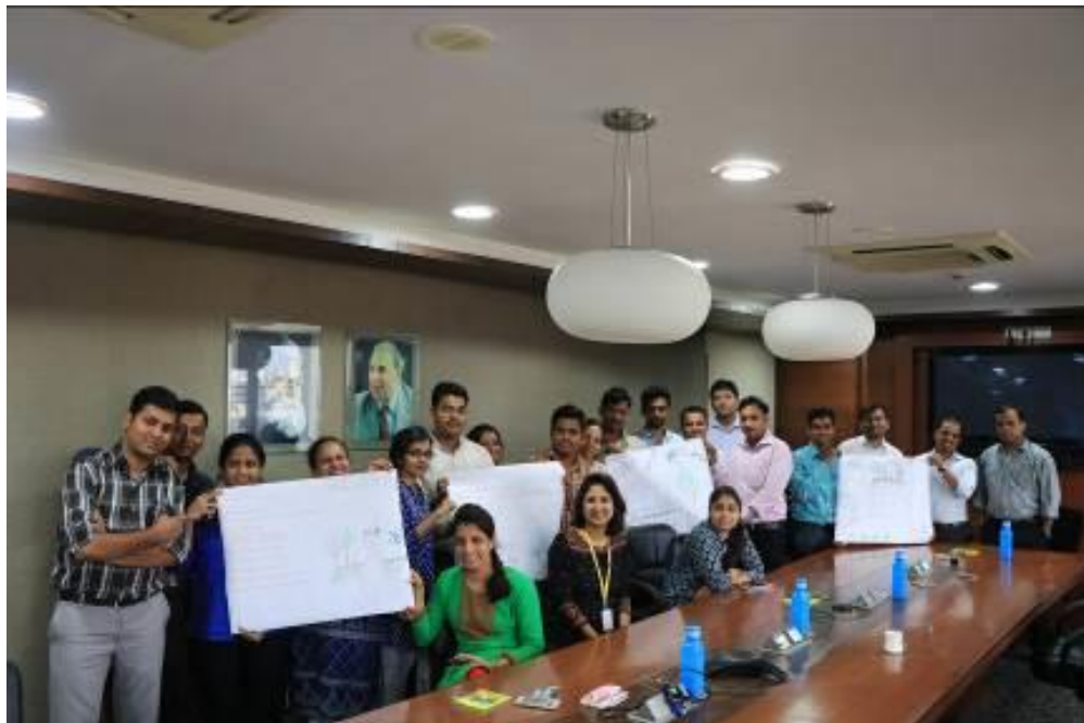
All the teams with their completed posters