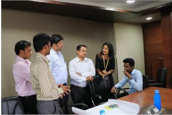
Guidance on creating the poster presentations