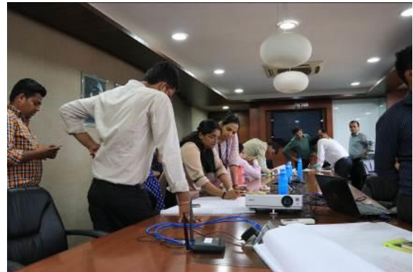
Teaming up and working in groups