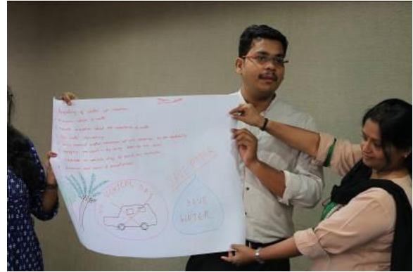
Presentation to the rest of the participants